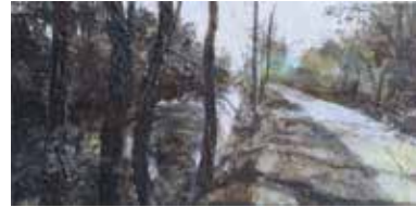
Image: Parallel, Past and Present (Ohio and Erie Canal) Acrylic on Fabric on Panel, 2017

Opening Reception: November 2 from 5:30 to 7:30 p.m.